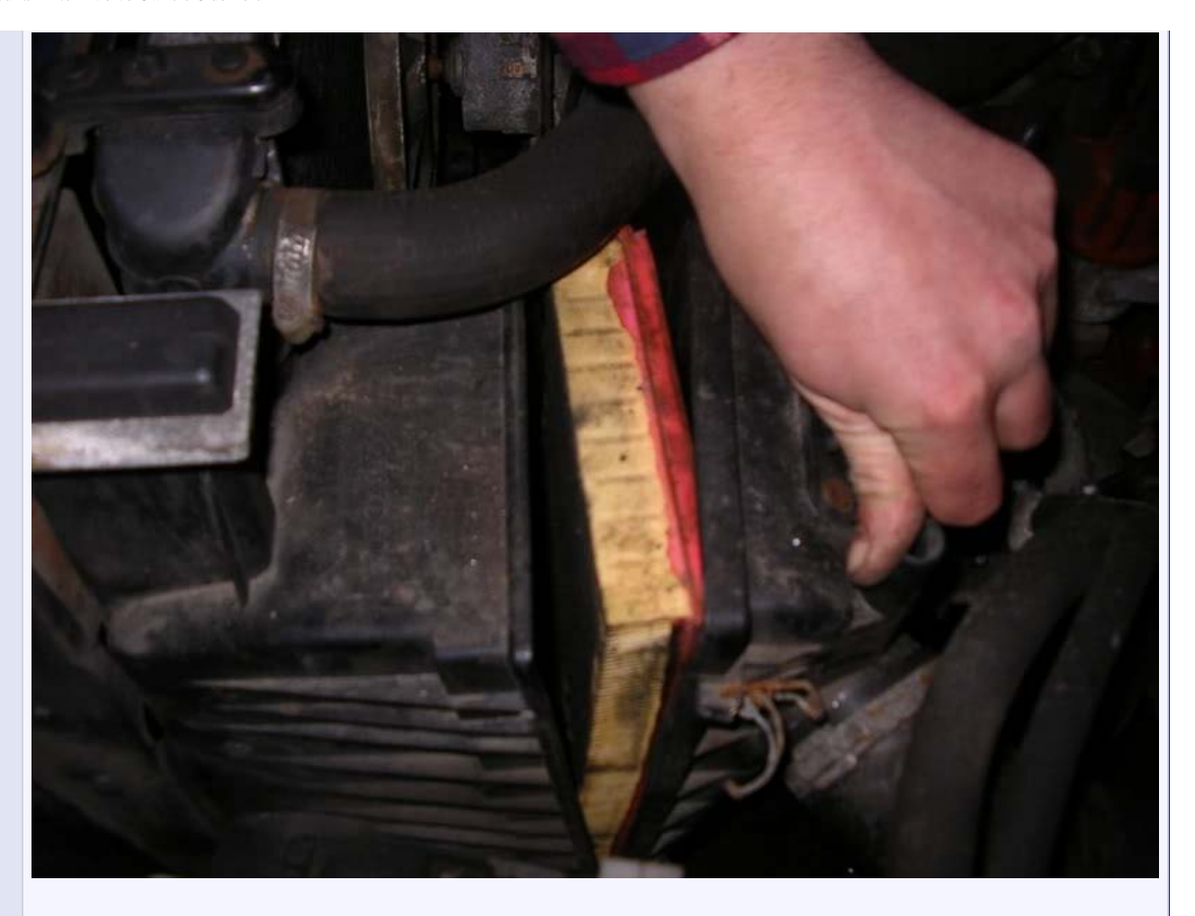
The filter can then be pulled out an d as can be seen his filter is very dirty and really overdue for change: