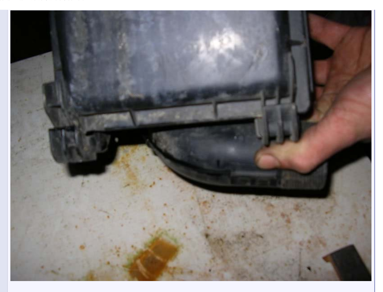
The new filter is bedded into the groove on the box itself: